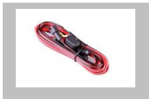
Charging cable (Standard)